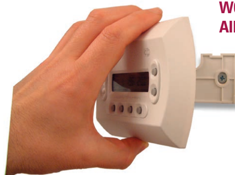
WCT 100/TX AIR SENSOR THERMOSTAT